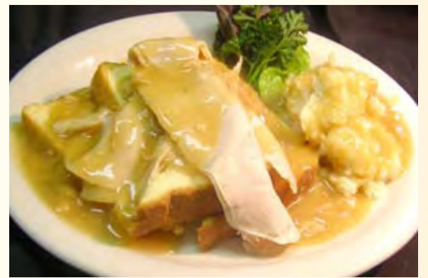
Open Faced Turkey Sandwich