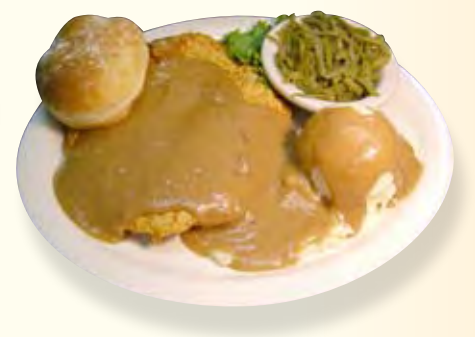
Country Fried Steak