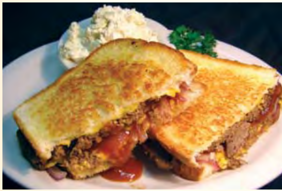
BBQ Meatloaf Melt

Sandwiches are served with your choice of Fries or Potato Salad, or trade for a Garden Salad for 1.50