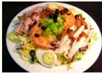
Bacon Chef Salad

Crisp battered chicken breast thinly sliced, mixed salad greens, tomatoes, bacon and shredded Cheddar cheese. 7.95