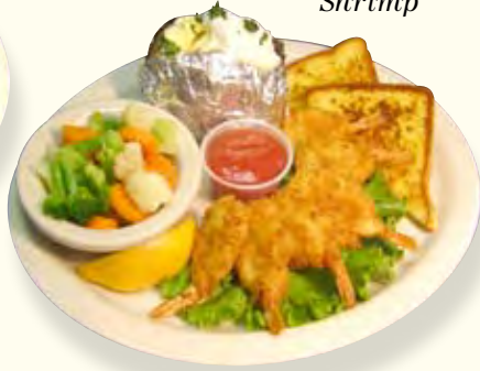
Deep Fried Shrimp