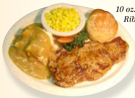
10 oz. Ribeye Steak

Dinners served with your choice of potato, vegetable and dinner roll. ADD Soup or Salad for 1.50