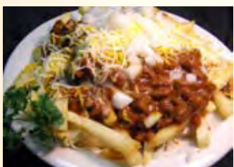
Chili Cheese Fries