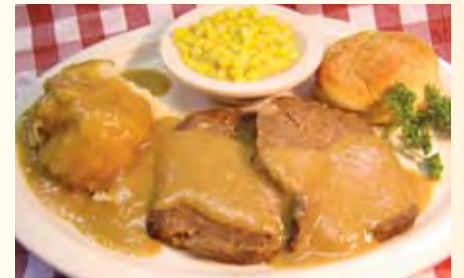
Old Fashioned Meatloaf