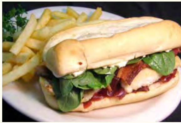
The Oregon Chicken